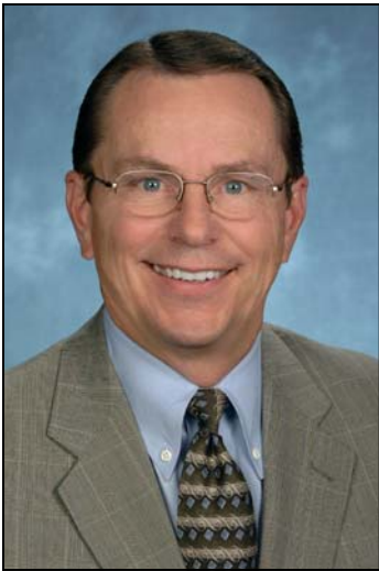
Newly-elected CIRT Chairman