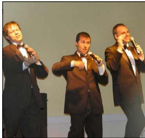
They look like waiters..... they work like waiters.....they are THE THREE WAITERS www.threewaiters.com