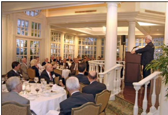
CIRT Members and guests listen to Newt Gingrich talk about “real change”.