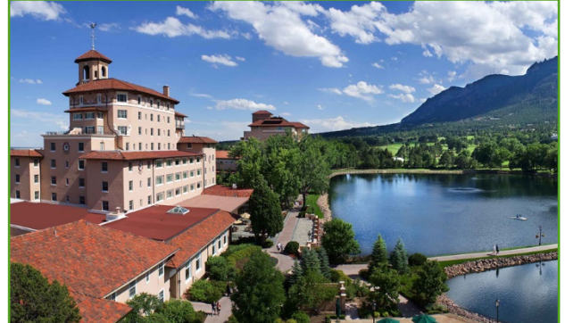
Colorado Springs, CO